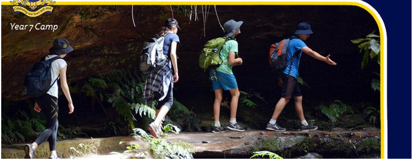
Year 7 Camp

Celebrating 100 Years ... .. of our Christian foundation